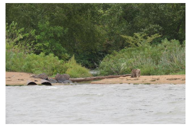
Elk River Connecting Channel – Elk River Outlet at High Tide