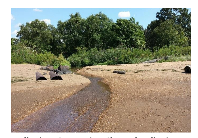
Elk River Connecting Channel – Elk River Outlet at Low Tide